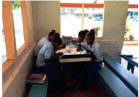
St Patrick's College students, classrooms and girls' dormitories