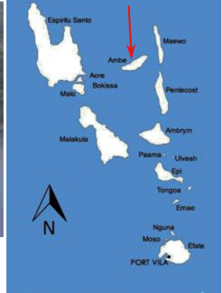
Right: Map of Vanuatu showing location of Ambae