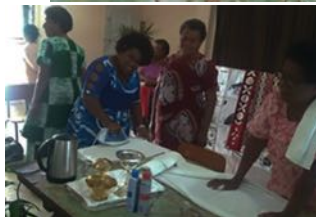
Above and Left: washing and ironing