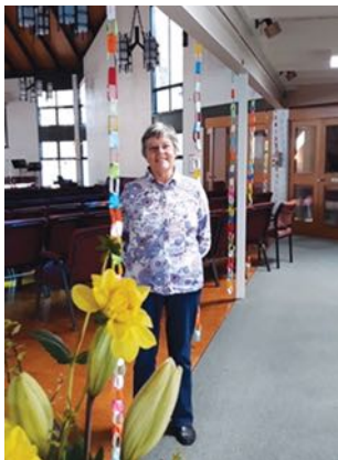
Right: The multi-coloured Prayer Chains hanging in the church