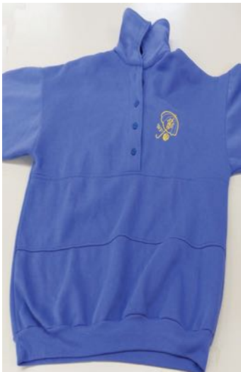
An AAW sweatshirt showing our original AAW Umbrella logo.