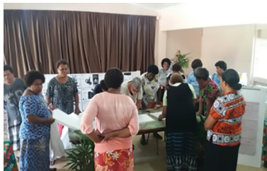
Above and Right: Cutting and sewing

cut, sew stoles; hand stitch purificators, and wash, dry and iron the linen/vestment and brasso/silvo the altar elements. We are fortunate to still have those who have acquired these set of skills over the years."