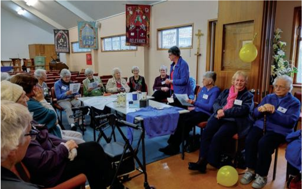
Above: Waikanae AAW members at their Golden Jubilee Celebration