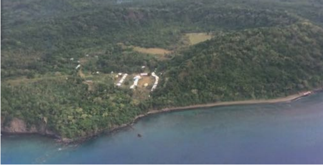
Above: Aerial view of College