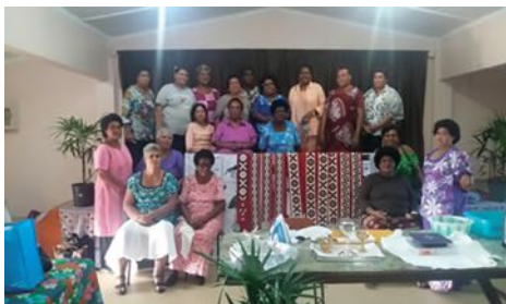
Some of the Suva-Ovalau AAW members who attended the workshop showing the completed stoles