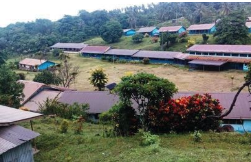
L: View of St Patrick's College and Below: a classroom block