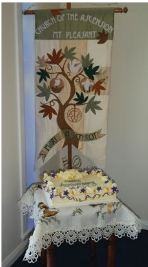
Above: The Golden Jubilee Cake in front of the AAW banner of the Church of the Ascension, Mt Pleasant, Christchurch and Right: Close-up of the special cake